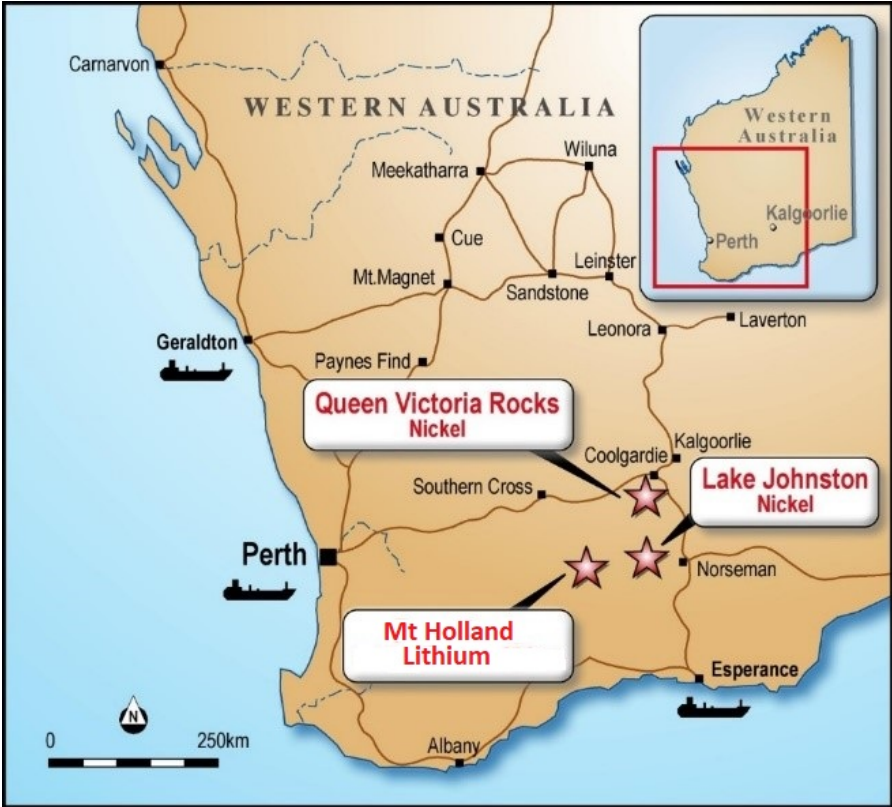
Figure 1: Location Map showing Hannans’ Forrestania Project (adjacent to Mt Holland Lithium) and Queen Victoria Rocks Project and Lake Johnston Joint Venture Project (Hannans free-carried)