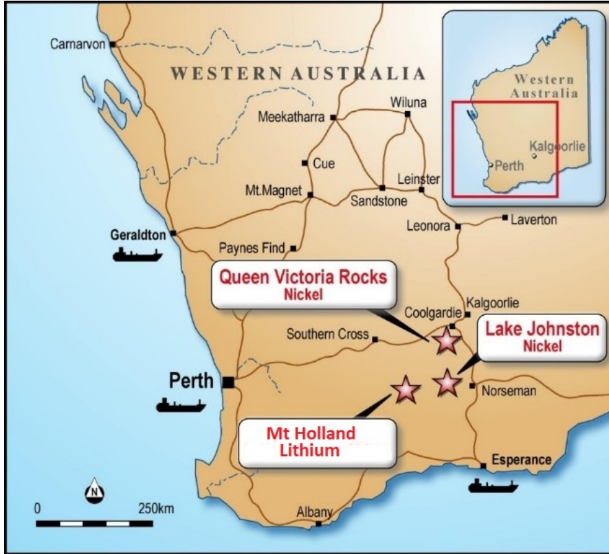
Figure 1: Location Map showing Hannans’ Forrestania Project (adjacent to Mt Holland Lithium) and Queen Victoria Rocks Project and Lake Johnston Joint Venture Project (Hannans free-carried)