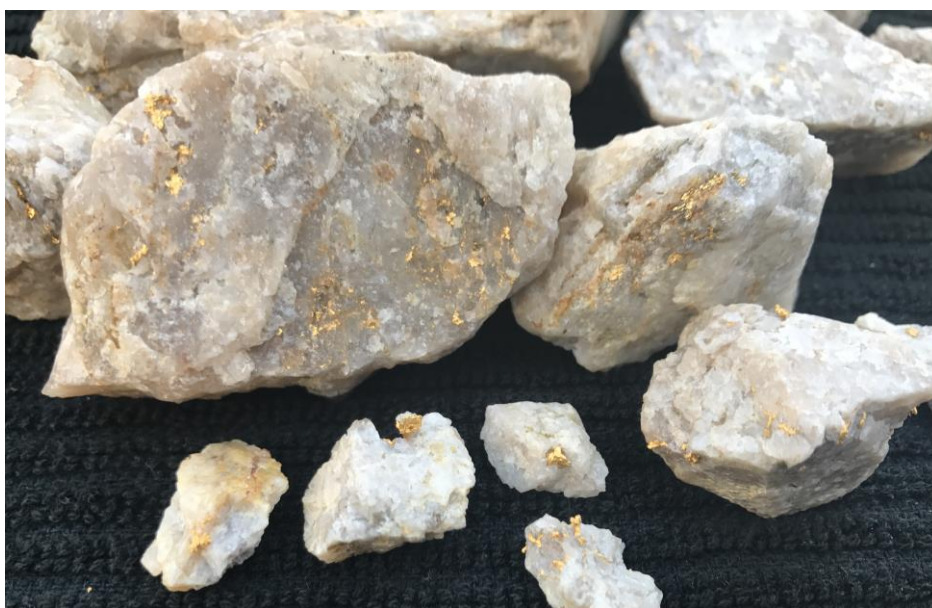
Figure 2: Example of visible gold in rock samples taken from around the Lady Ada deposit (see announcement dated 12 Sept 2017)